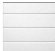
Minor Ribbed Panel