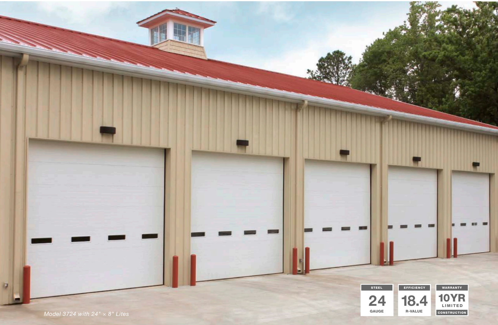
Model 3724 with 24" x 8" Lites