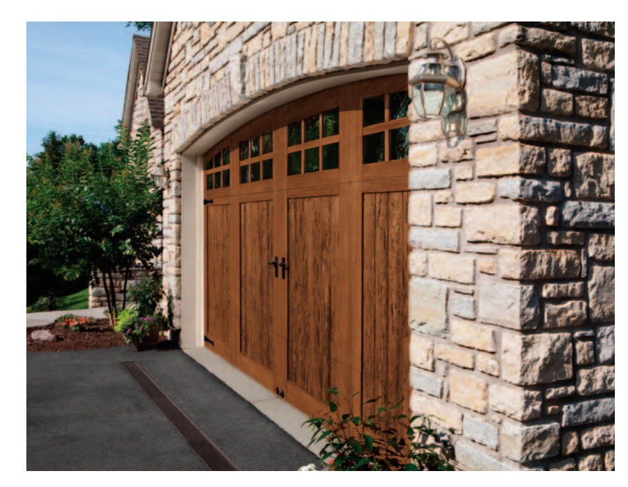
Design 11 shown in medium finish, ARC4A Window Design. Optional Decorative Handles with Keyhole, Spade Strap Hinges and Fleur de Lis Step Plate. (Model CAN211PCARC3A)

The Canyon Ridge® Collection provides the natural beauty of wood with the durability and low maintenance of an innovative polymer cladding and overlay. The end result is an authentic faux wood door that duplicates every aspect of the charm and character of wood. The cladding and overlay material are molded from actual wood to replicate its natural texture and intricate grain patterns of Pecky Cypress, Clear Cypress and Mahogany. Lightweight, durable and very easy to maintain, these rustic beauties are virtually indistinguishable from the original.