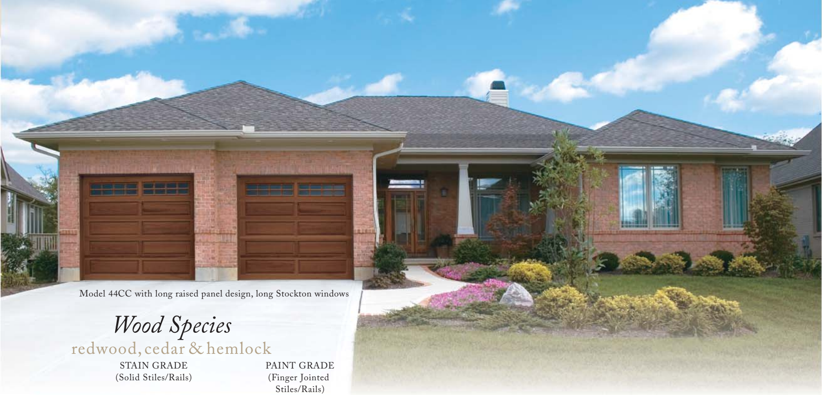
Model 44CC with long raised panel design, long Stockton windows

Additional height/panel configuration options are available on opposite page.