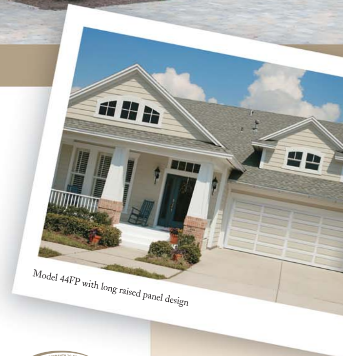
Model 44FP with long raised panel design

Warm. Distinctive. Timeless. These are qualities that make a home stand out. With handcrafted raised panel wood garage doors in stain grade or paint grade options, yours is sure to be a focal point among the others on the block.