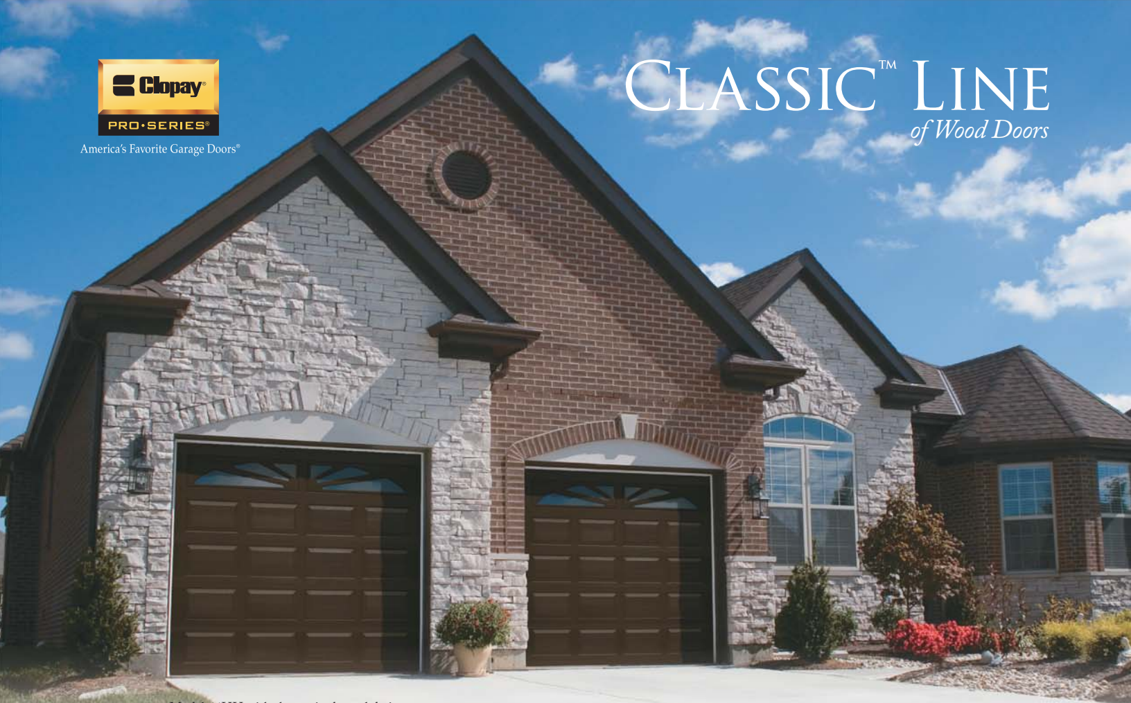
Model 44HH with short raised panel design, long Horizon windows

Get the look you want and the ease of operation you require