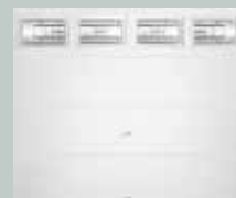
Art Deco I & II