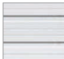
Ribbed Panel Design