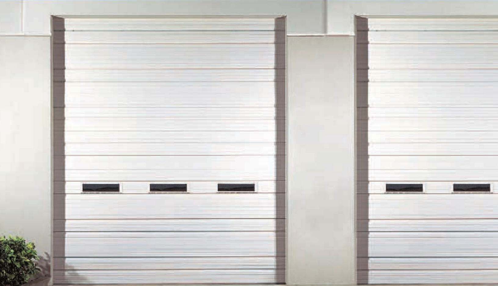
Model 520 with 24" x 6" Lites