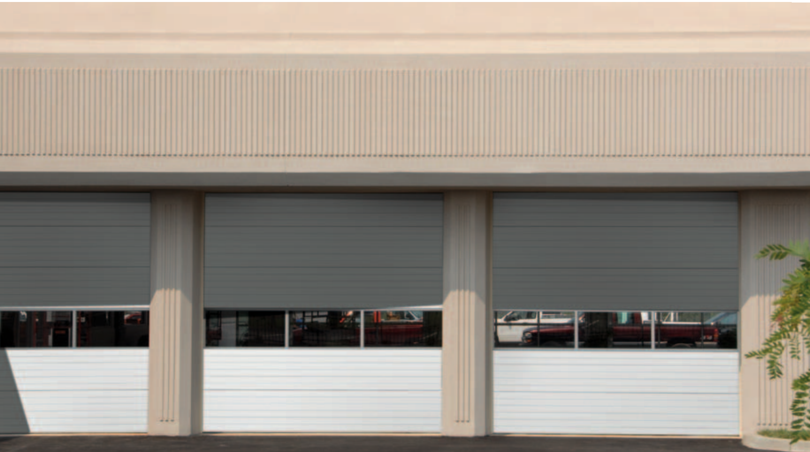
Model 3720 with Full Vision Section