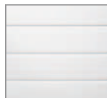
Light Ribbed Panel