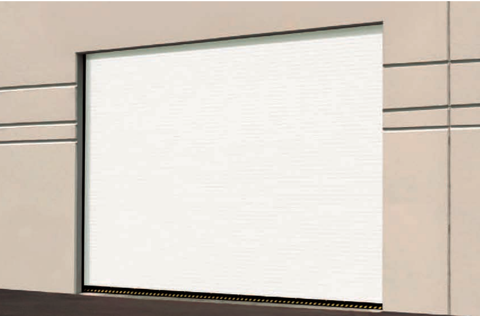
Model CESD10 Rolling Steel Door