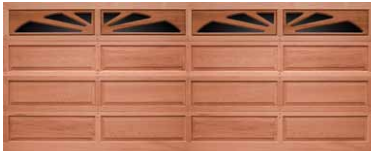
Horizon (16' Wide)