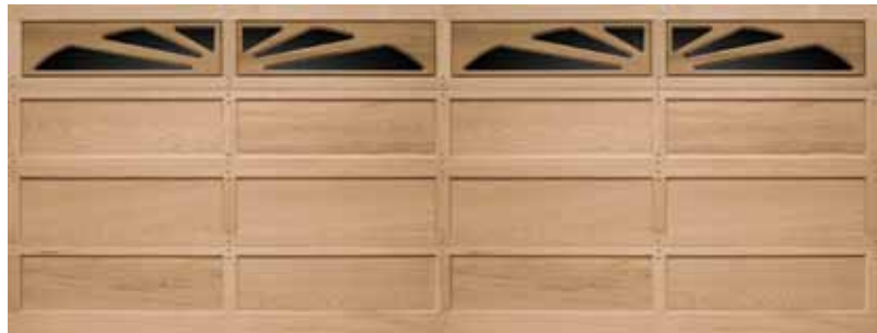
Horizon (16' Wide)