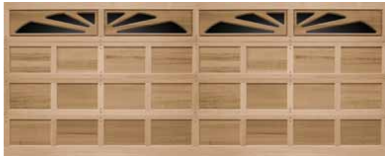
Horizon (16' Wide)