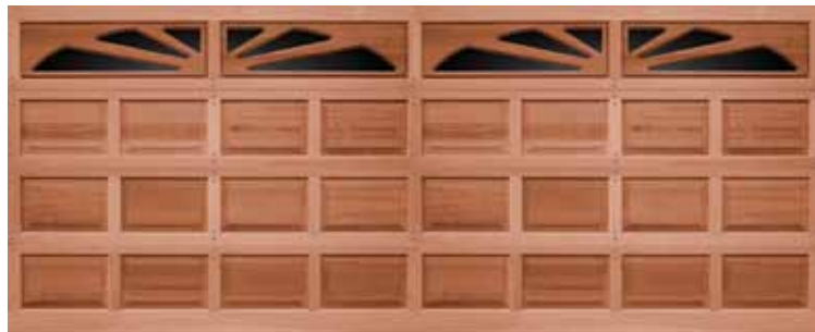
Horizon (16' Wide)