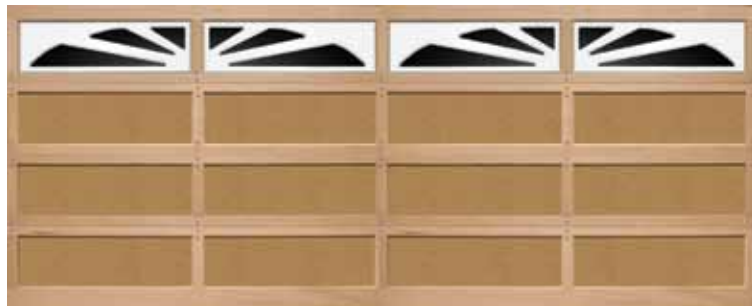
Sunset (16' Wide)