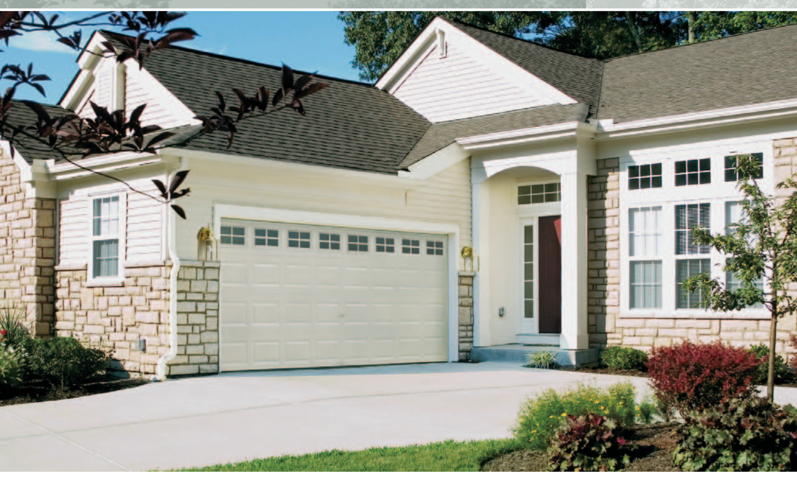
Model 1000 Short Traditional Panel with Optional Colonial 509 Window Design

With a two-layer construction of polystyrene insulation bonded to 25 gauge steel, Models 1000, 1001, and 1100 are built to be quiet and durable. Three panel options, four finished colors, as well as many beautiful window options, provide the right look for your home's style.