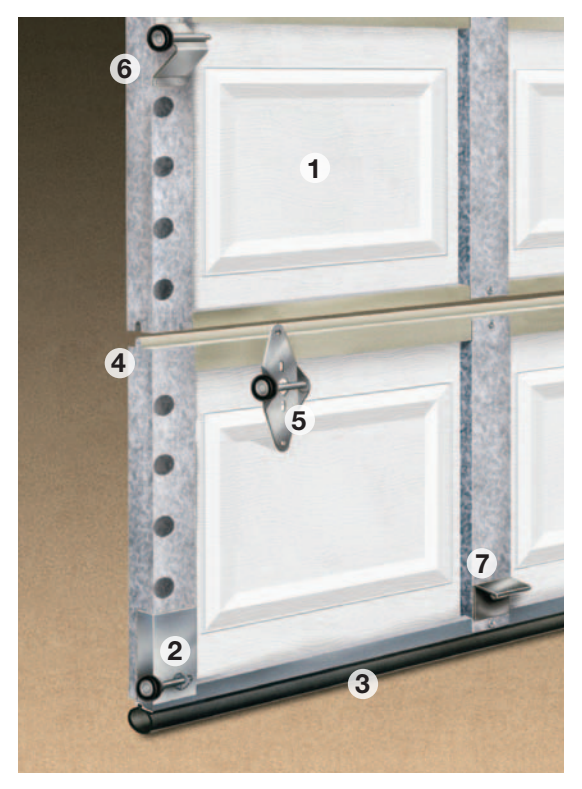
Illustration for Models 73 and 76 is for component location purposes only. Actual product has pilot holes on end stiles.