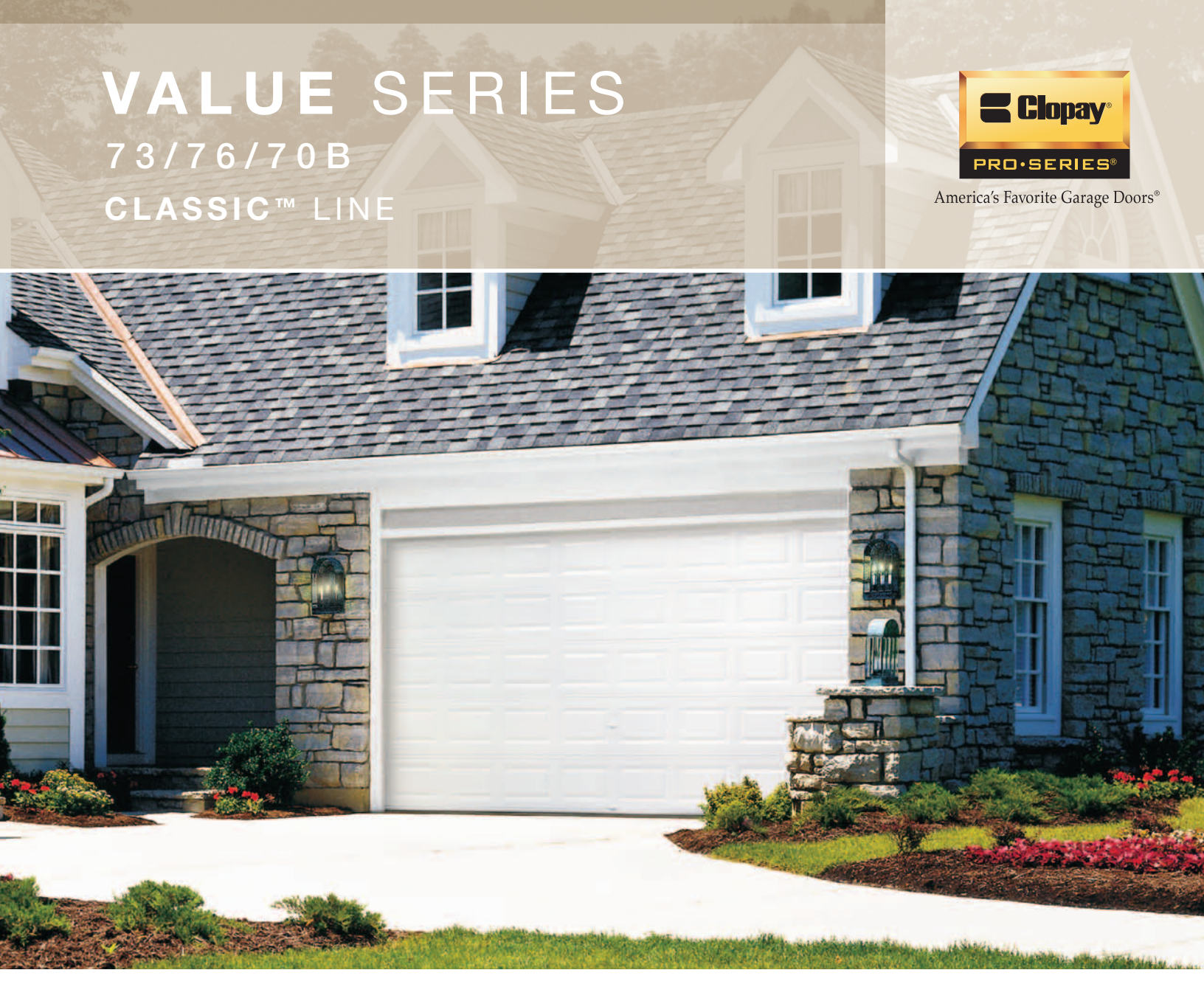
Model 73 Short Traditional Panel Design

With a 2" durable steel frame construction and three panel styles, the Models 73, 76 and 70B Series doors are designed for beautiful, long-lasting performance. Combine five color options on the Models 73 and 76 along with many Designer and Decorative window designs and you have the best value door to suit your home style and lifestyle.