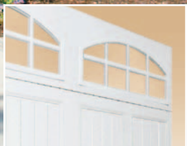
Large Authentic Arch Window Designs

First impressions are lasting impressions.