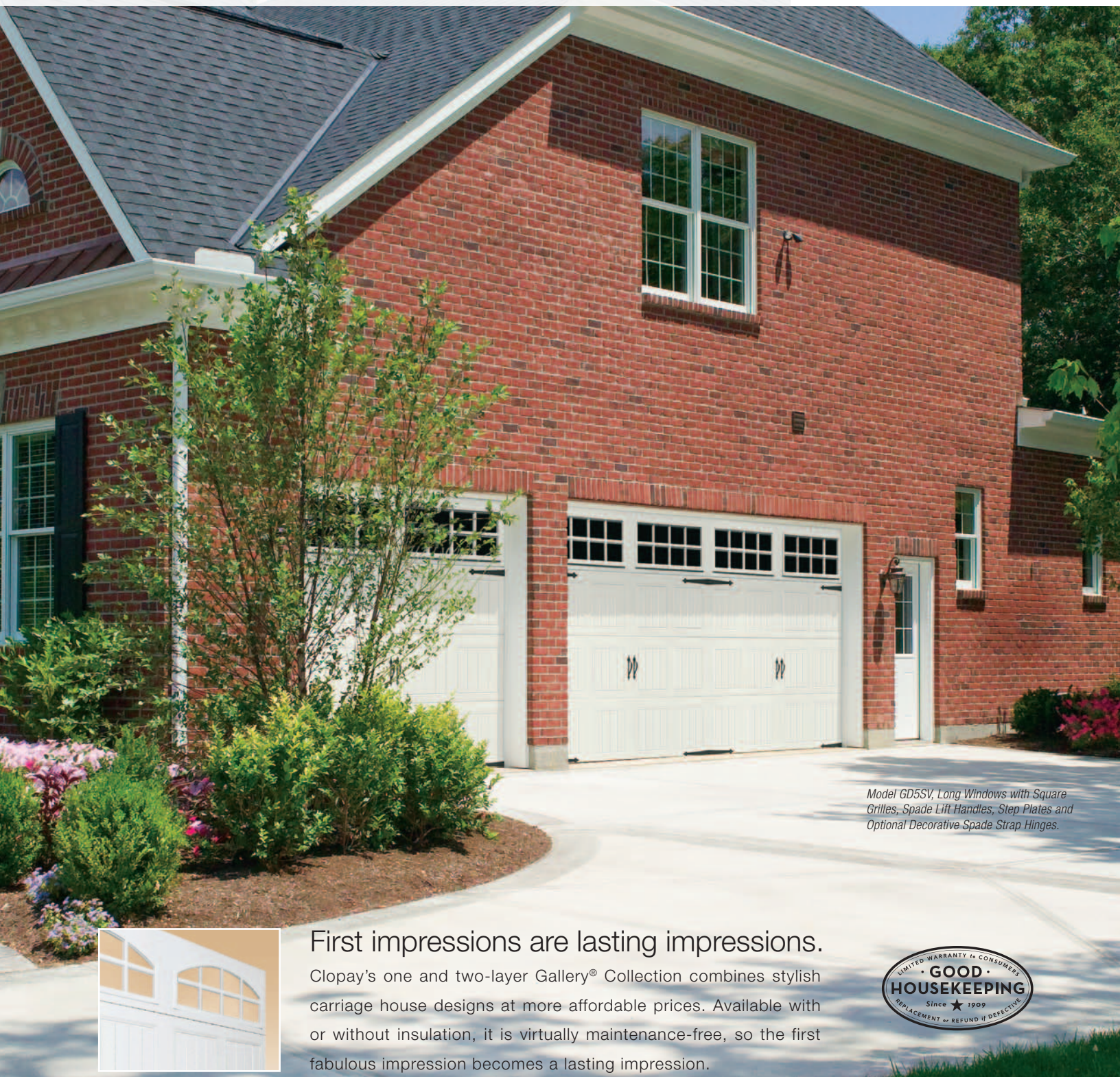
Model GD5SV, Long Windows with Square Grilles, Spade Lift Handles, Step Plates and Optional Decorative Spade Strap Hinges.