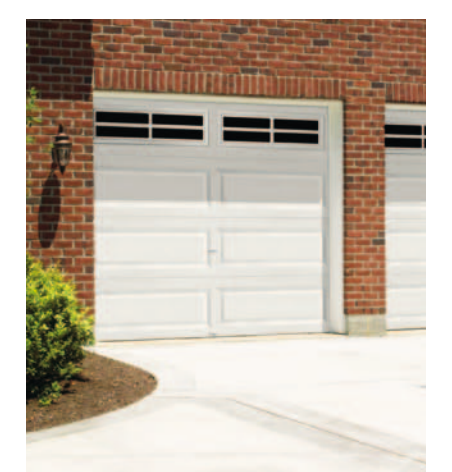
Model T52L Long Traditional Panel with Optional Colonial 609 Window Design

Deep panel edging and natural embossed woodgrain texture improve appearance close-up and from the curb.