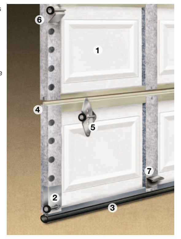
Illustration for Models T50S and T50L for component location purposes only. Actual product has pilot holes on end stiles.