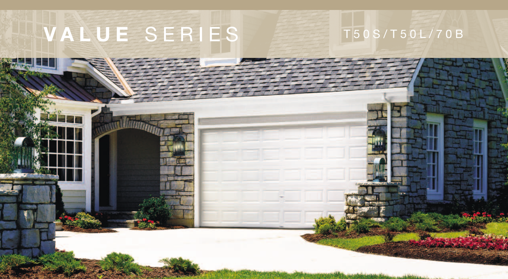
Model T50S Short Traditional Panel Design