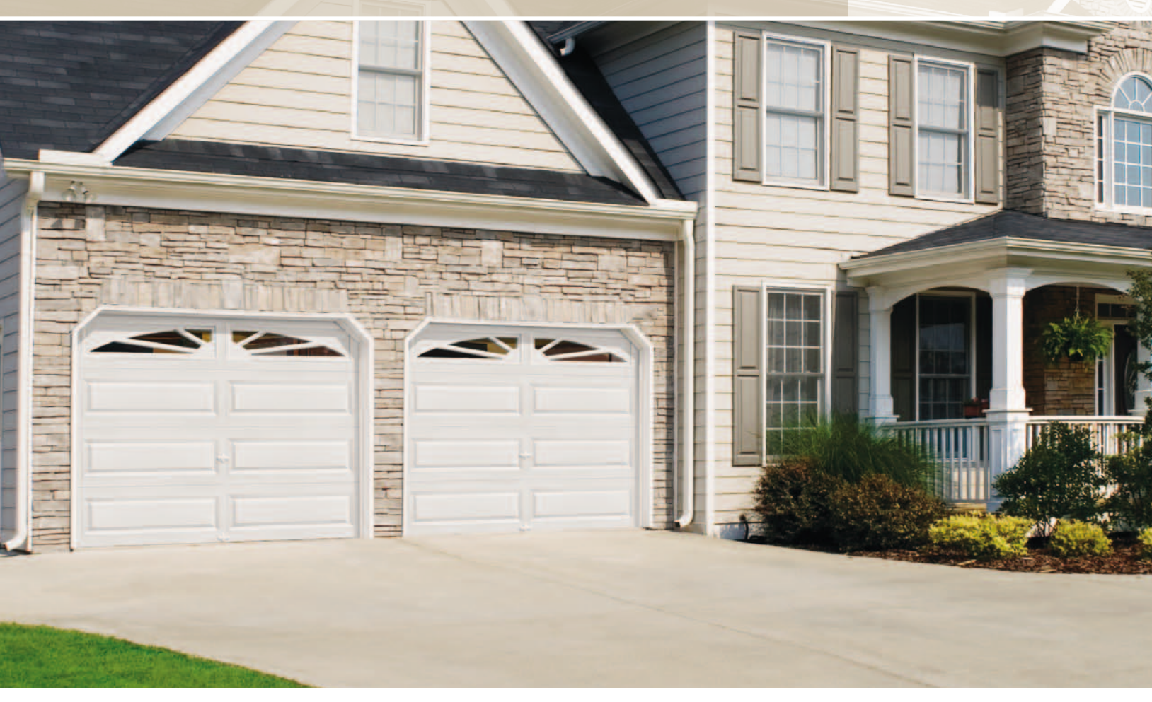
Model T50L Long Traditional Panel with Optional Sunset 603 Window Design

With a 2" durable steel frame construction and three panel styles, the Models T50S, T50L and 70B doors are designed for beautiful, long-lasting performance. Combine five color options on the T50 Series along with many Designer and Decorative window designs and you have the best value door to suit your home style and lifestyle.