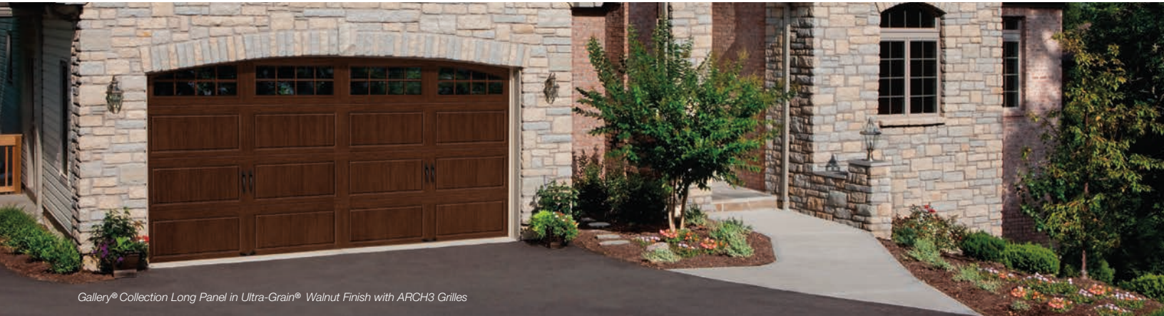
Gallery® Collection Long Panel in Ultra-Grain® Walnut Finish with ARCH3 Grilles