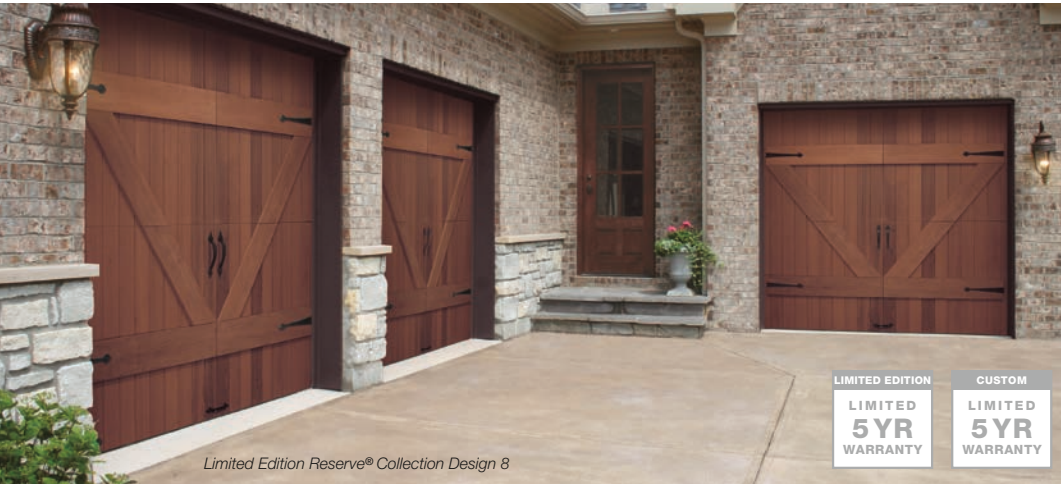
Limited Edition Reserve® Collection Design 8