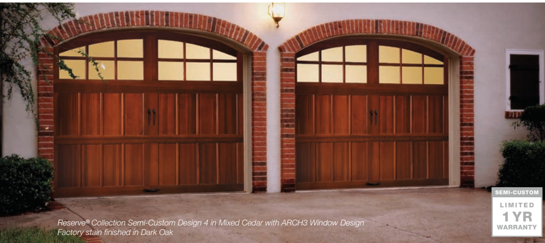
Reserve® Collection Semi-Custom Design 4 in Mixed Cedar with ARCH3 Window Design Factory stain finished in Dark Oak