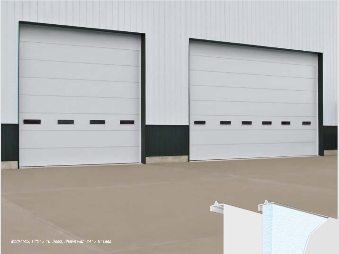
Model 522, 14'2" x 16' Doors; Shown with 24" x 6" Lites